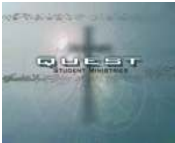
Greetings from Quest Student Ministries!