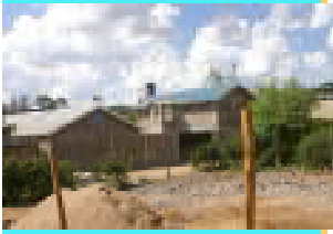
School they worked on at Africa Nazarene School of Extension.